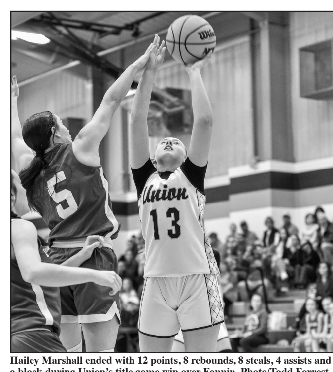
a block during Union's title game win over Fannin.